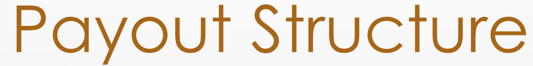
PLAN - A